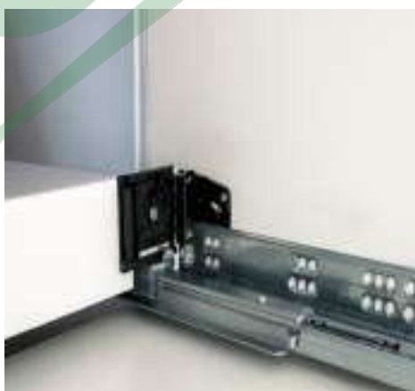
木抽定位器 CLICK Stop