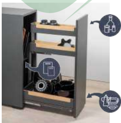
| 櫃寬 | 300mm