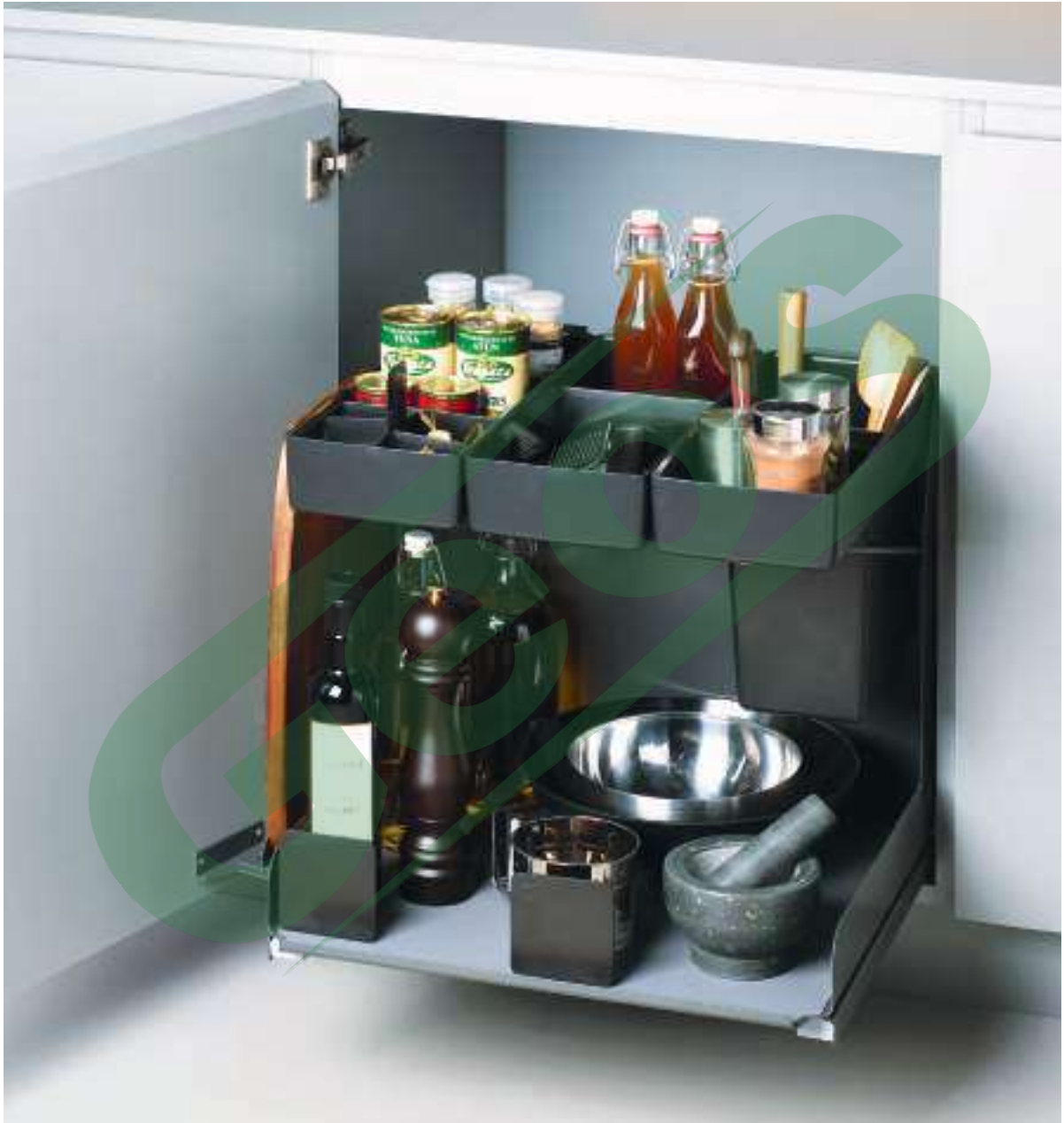
多功能連動收納架 KITCHEN TOWER

Items that belong together should be stored together – in a single unit.