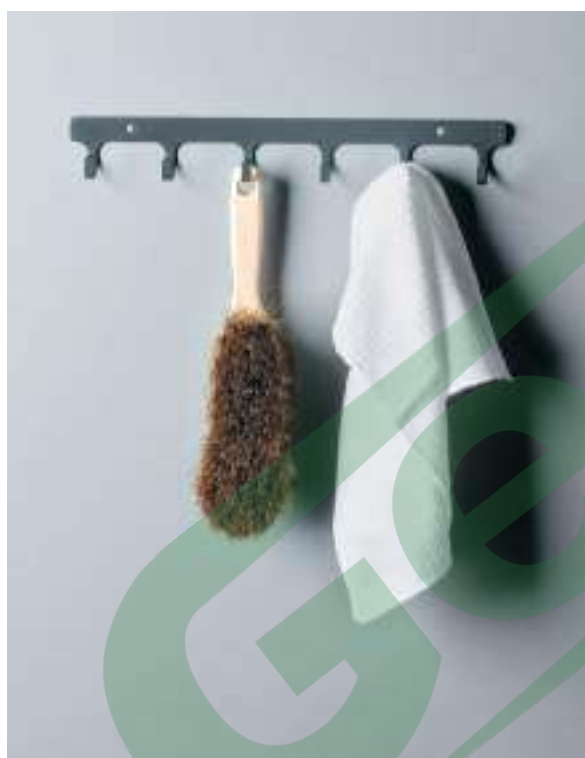
盤籃用掛勾 | 顏色 | 鐵灰 | 寬x高x深 | 360x44x54mm

Even a cleaning cupboard can be neat and attractive!