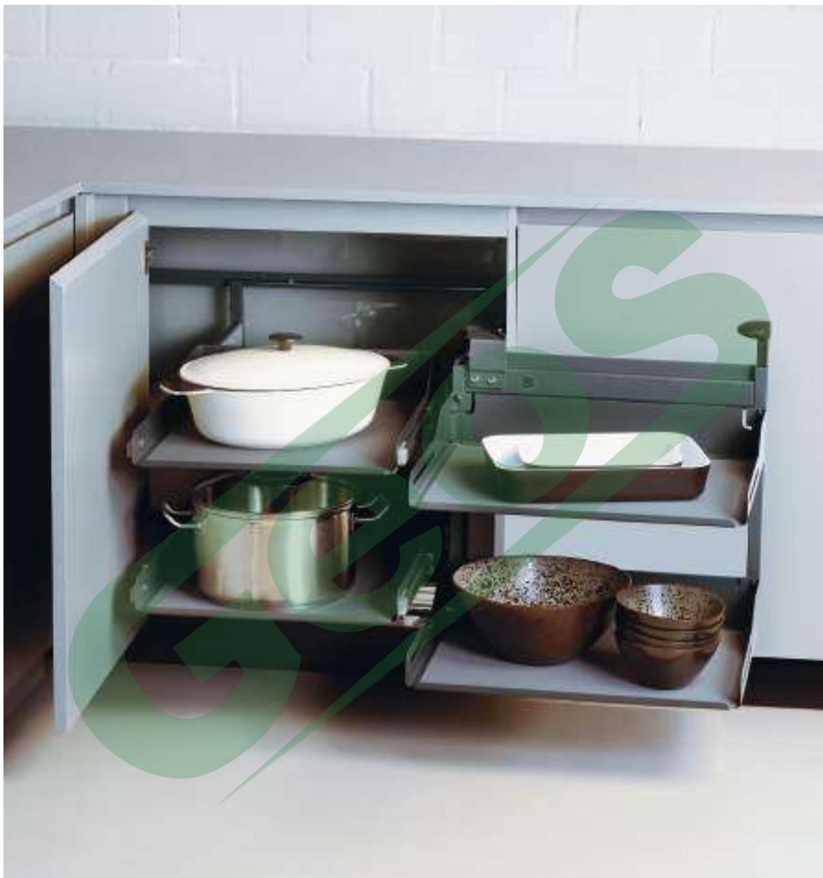
開放式全拉小怪物 MAGIC CORNER COMFORT