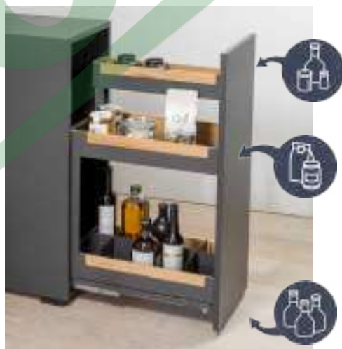
| 櫃寬 | 200/300mm