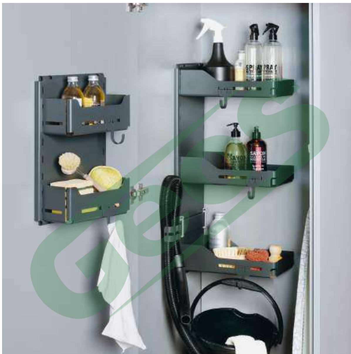
儲藏室迷你收納 MINI SESAM | 顏色 | 鐵灰 | 寬x高 | 400x434mm