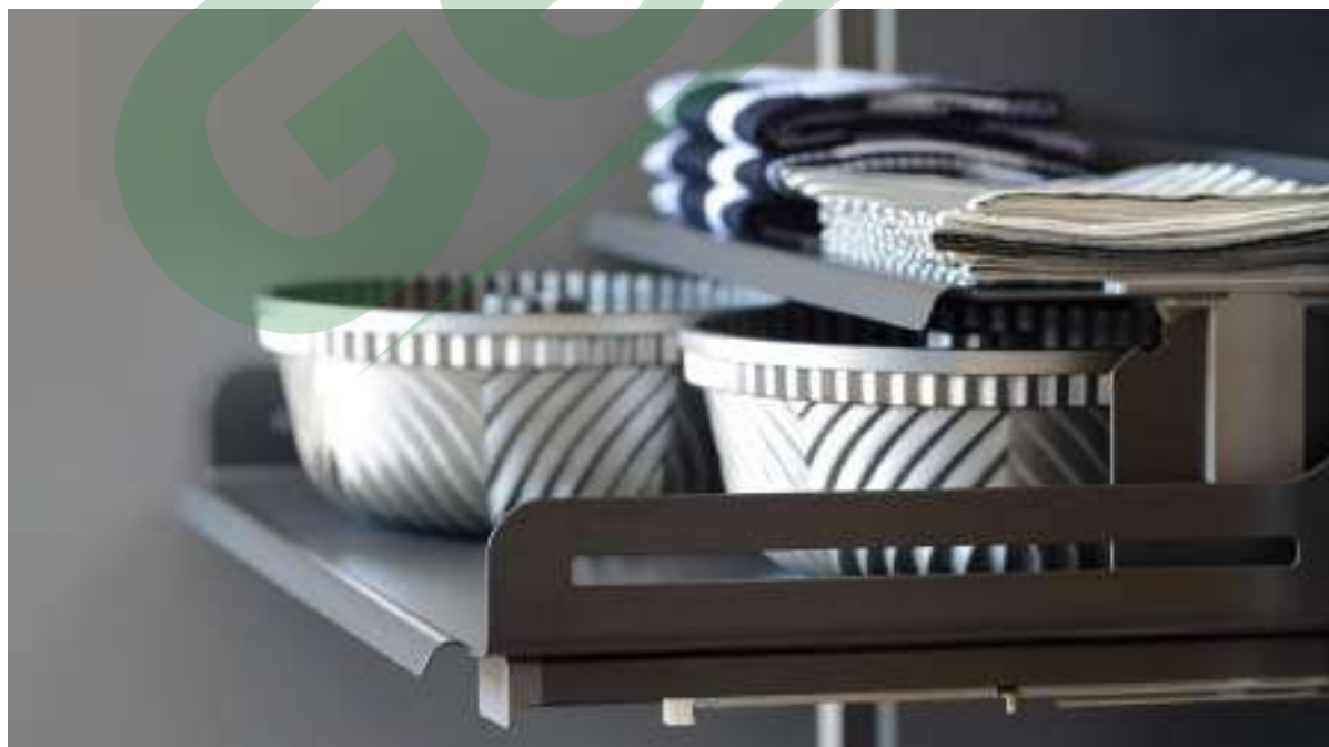
盤籃加高架 SHELF | 櫃寬 | 600/900mm