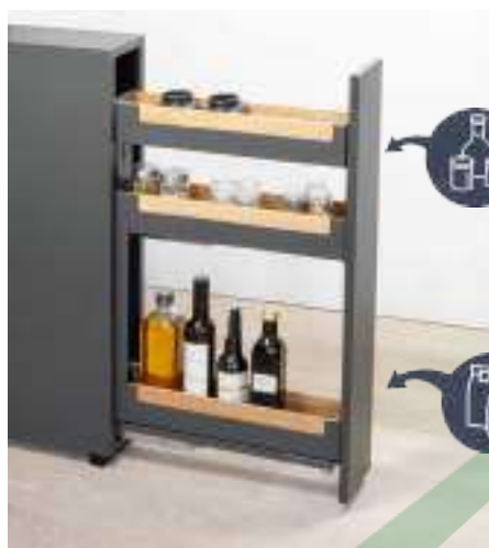
| 櫃寬 | 150mm