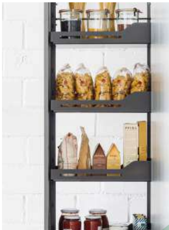
門板式盤籃高身櫃 | 顏色 | 鐵灰 STANDARD | 櫃寬 | 150/300/400mm | 實內高度 | 1600-2260mm