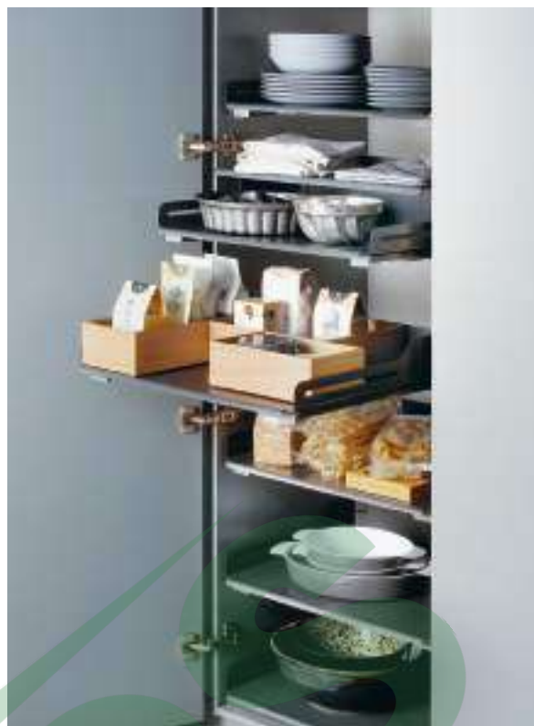
開放式盤籃 | 顏色 | 鐵灰 EXTENDO | 櫃寬 | 450/600/800/900mm | 盤籃深度 | 495mm