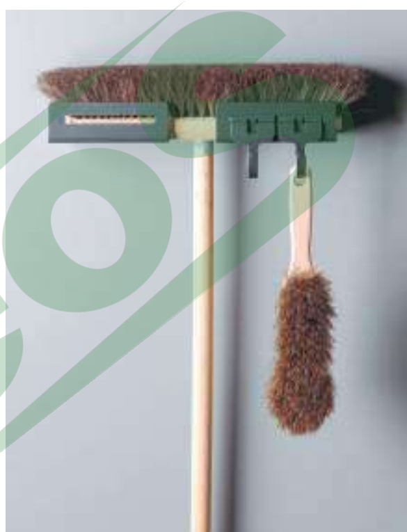
掛帚架 + 掛勾x2 | 顏色 | 鐵灰 | 寬x高x深 | 330x75x85mm