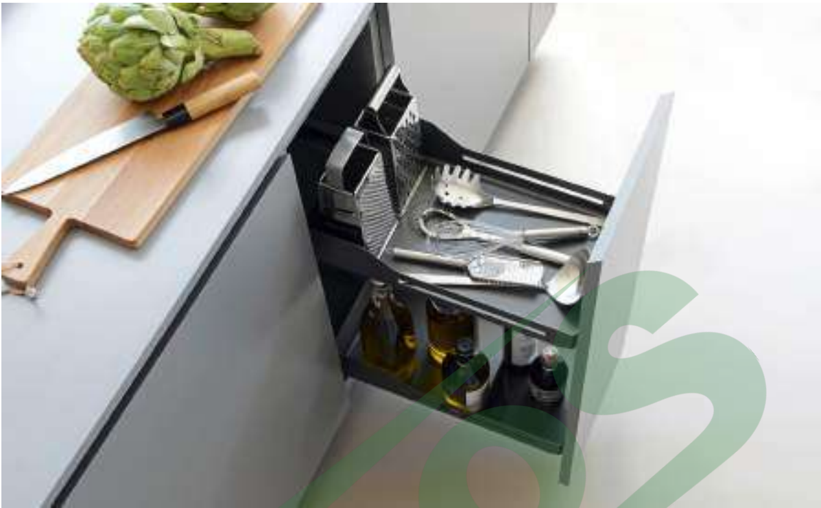
小側拉 SNELLO | 顏色 | 鐵灰 | 櫃寬 | 150/200/300mm | 實內高度 | 520mm

Day-to-day use soon highlights the difference between good design and perfect design.