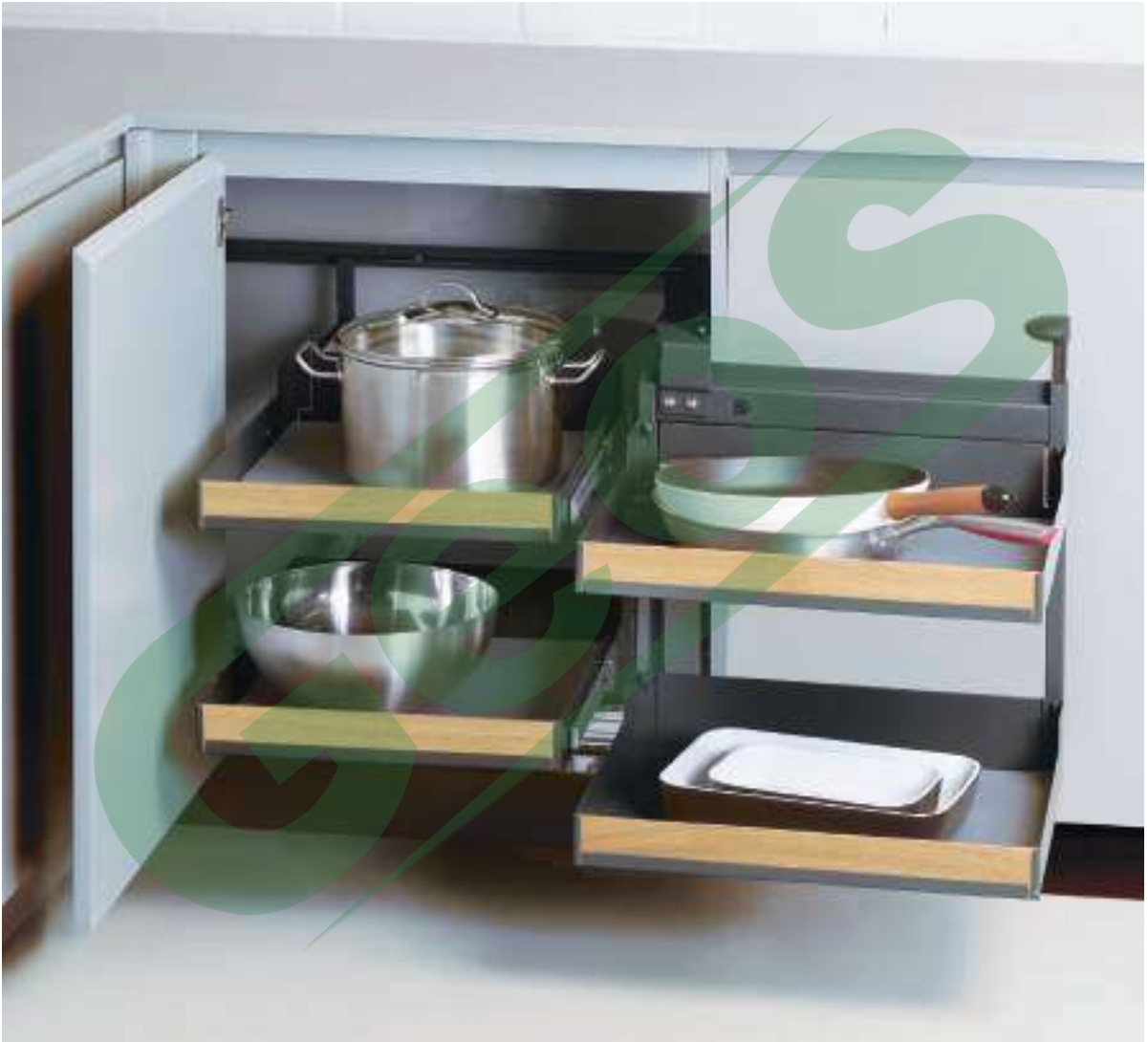
開放式全拉小怪物 MAGIC CORNER COMFORT

Cooking is so much easier when everything is organised!