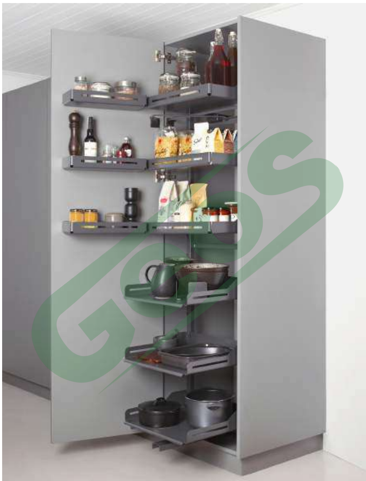
連動骨架半怪物 PLENO PLUS